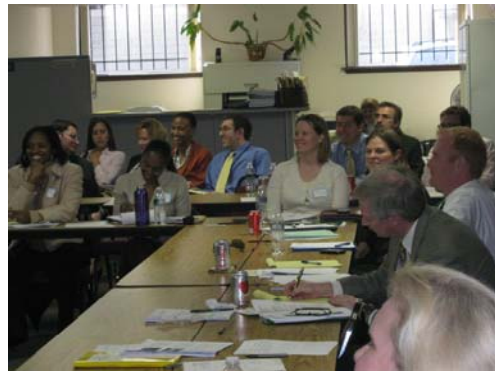
Pro Bono participants gather in conference room at Fourth Circuit Public Defender's Office