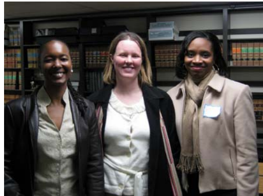
Local attorneys became SAPD's and earned CLE credits